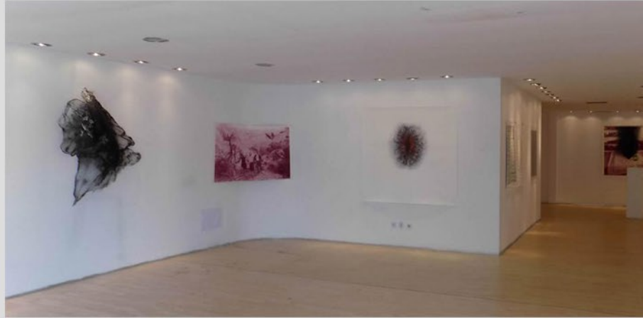
Location of art fair

The Thessaloniki International Contemporary Art Fair is organized by the National Exhibition Agency of Greece and brings together artists and galleries from around the world specializing in contemporary and modern art of all media including painting, sculpture, photography, video and mixed media.